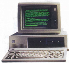
1981 FIRST PC IBM 5150 PC, 12.7kg (with two diskette drives).

While computers have been used since the middle of the 20th century, PCs are a little younger, having only just recently ticked past their third decade of existence.