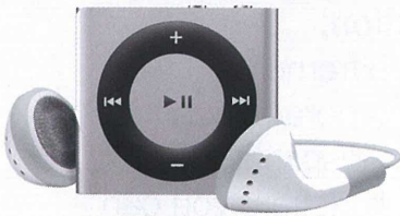
IPOD SHUFFLE (Fourth Generation)