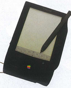
1993 MESSAGEPAD Powered by Apple Newton system, 640g.