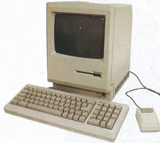
1984 FIRST APPLE MACINTOSH 8MHz processor, 7.5kg.