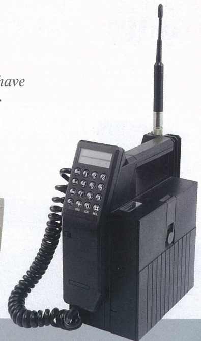
TELECOM MOBILE PHONE

Although it would make for a very good weights set these days, the very first commercially successful portable computer was breakthrough technology in its day. Today's sophisticated 10-inch tablets are obviously far superior in terms of technology that is both cutting-edge and, most importantly, portable.