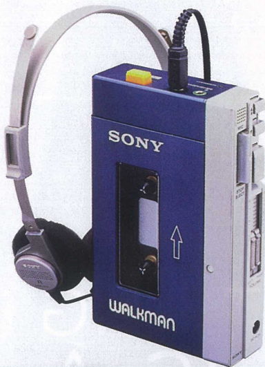
SONY WALKMAN TPS-L2

As gadgets have shrunk in size their capabilities have expanded — in some cases, quite remarkably.