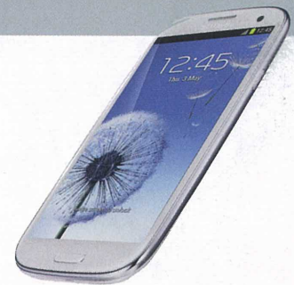
SAMSUNG GALAXY S III