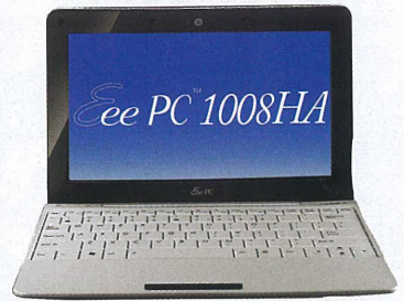
2007 ARRIVAL OF THE NETBOOK Asus Eee PC, 920g.